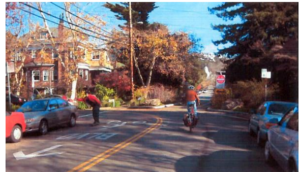
Example of a Traffic Diverter

The Floyd Avenue Bicycle Boulevard project will convert a portion of Floyd Avenue into a preferred route for bicycle traffic, while accommodating low-speed local motor-vehicle traffic. Bicycle Boulevards incorporate design elements that optimize bicycle transportation by giving through-traffic priority to bicyclists.