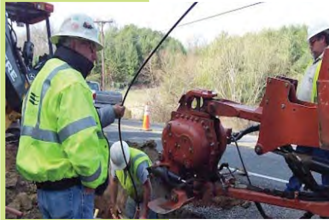
New River Valley Community Regional Broadband Network

The document contains an economic overview of the New River Valley; including a brief history, current trends, and up-to-date data on the region. Goals and objectives are designated based on this evaluation and projects are identified by a Comprehensive Economic Development Strategy Committee, made up of a majority of private sector participants as well as public sector representatives. Projects included in the CEDS demonstrate priorities in the region. Some familiar projects with a portion of EDA funding are Virginia Tech's Corporate Research Center, NRV Commerce Park Water and Sewer project, and the Carilion Giles Memorial Hospital.