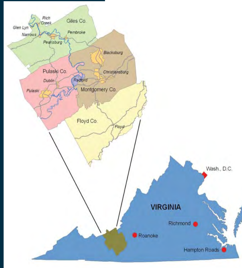
New River Valley Commerce Park Water and Sewer-Tank Bolting Ceremony

Source: Virginia Employment Commission, 2012 NRV Profile.